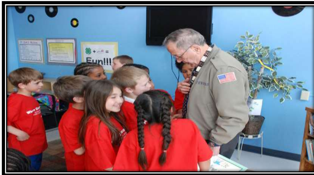
Sen. Ted Stevens